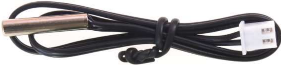
W1209 Temperature Control Switch